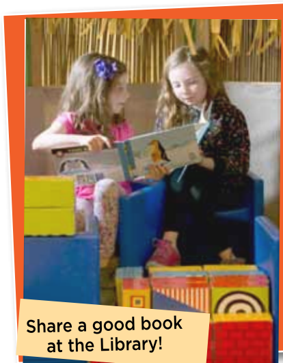
Share a good book at the Library!

Thurs., Sept. 27 @ 4 - 5 PM Registration begins Sept. 11 Ages 7 - 12 Bring a device with Minecraft loaded & do a series of in-game, timed building challenges!